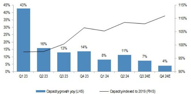
Figure 28: Transatlantic capacity growth, in ASKs yoy