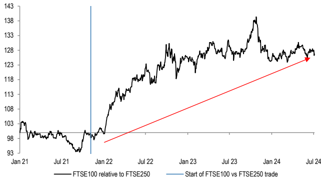
Figure 8: FTSE100 vs FTSE250 since Jan'21