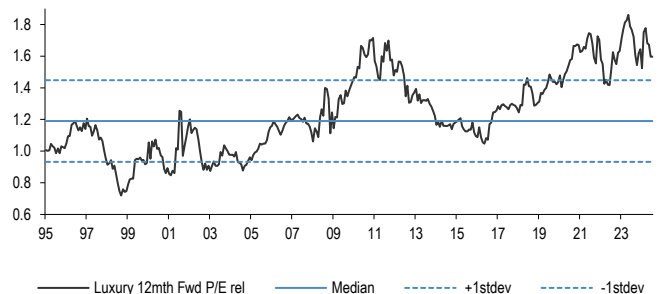
Figure 22: European Luxury 12m Fwd P/E relative

Luxury has also struggled in the past months, and we have cautioned that pricing in the sector could come under pressure - see report . Our sector analysts flag muted earnings momentum for the group, and see few positive catalysts for 2H. The key stock within the sector, LVMH, is likely to see topline soften for most segments. This, coupled with FX headwinds, should lead to EBIT margin pressure - see report .