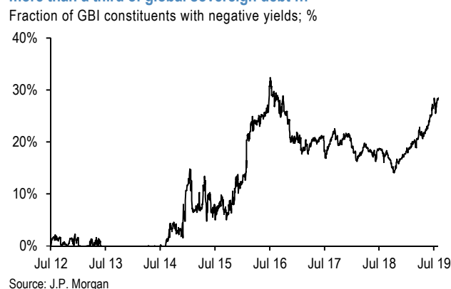
Figure 6: Over the past few years negative yields have enveloped more than a third of global sovereign debt ...

the assumption that capital controls and lack of free float make them very unattractive reserve assets. Consistent with this COFER data published by the IMF suggests that global FX reserves include a small (~1%) exposure to CNY.