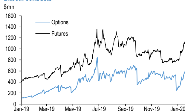
Figure 2: Aggregate open interest across CME and Bitmex Bitcoin contracts

The combined option open interest at Derebit/LedgerX is decent at around $500mn, in dollar terms around half of the futures open interest we see at Bitmex and CME together (Figure 2). This suggests that there is genuine demand for non-linear institutional trading products in crypto markets.