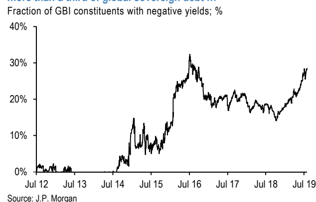
Figure 6: Over the past few years negative yields have enveloped more than a third of global sovereign debt ...

the assumption that capital controls and lack of free float make them very unattractive reserve assets. Consistent with this COFER data published by the IMF suggests that global FX reserves include a small (~1%) exposure to CNY.