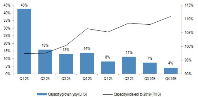
Figure 28: Transatlantic capacity growth, in ASKs yoy