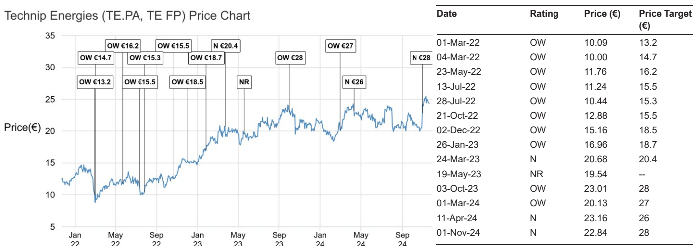
Technip Energies (TE.PA, TE FP) Price Chart

Source: Bloomberg Finance L.P. and J.P. Morgan; price data adjusted for stock splits and dividends. Initiated coverage Mar 01, 2021. All share prices are as of market close on the previous business day.