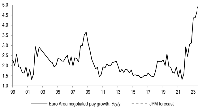
Figure 18: Euro area negotiated pay growth

The strong improvement in productivity was a big factor behind the resilience in margins over the past year, but that could have been flattered by elevated topline growth, which was supported by one-off factors such as excess liquidity and the aggressive government spending. Even though the labour market was extremely tight and delivered higher wages, the strong output has kept unit labour costs in check.