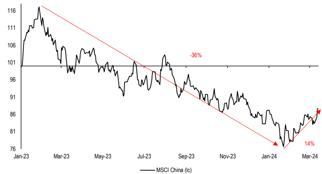
Figure 17: MSCI China