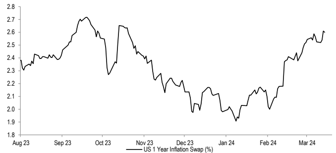
Figure 27: US 1-year inflation swap

At the same time, inflation has been increasing again of late.