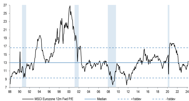
Figure 6: MSCI Eurozone 12m Fwd. P/E

Even adjusted for sector biases, Eurozone screens attractive. On sector neutral P/E, it is trading at one of the cheapest P/E relatives seen in pre-COVID times.