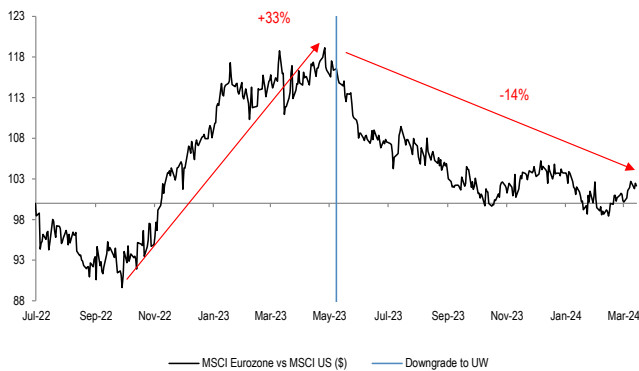
Figure 1: MSCI Eurozone vs MSCI US

Post the strong start to '23, Eurozone equities have lagged the US since May