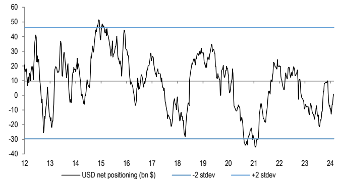
Figure 27: USD net positioning

...S&P500 earnings are more international than NIPA profits... if USD strengthens, S&P500 earnings might not be able to outperform NIPA