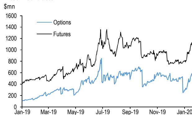
Figure 2: Aggregate open interest across CME and Bitmex Bitcoin contracts

The combined option open interest at Derebit/LedgerX is decent at around $500mn, in dollar terms around half of the futures open interest we see at Bitmex and CME together (Figure 2). This suggests that there is genuine demand for non-linear institutional trading products in crypto markets.