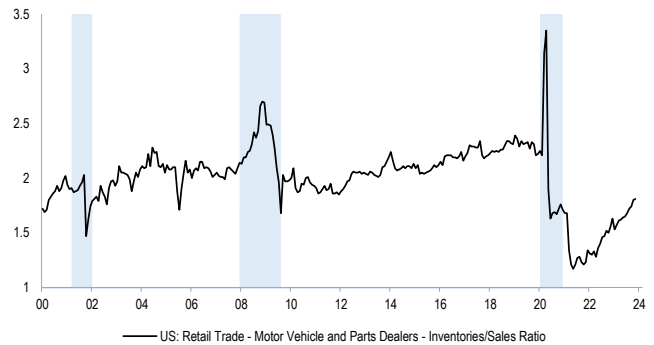
Figure 14: US Retail trade - Motor Vehicle Inventory/sales

At the same time, the supply chain distortions created by COVID-related shutdowns created huge supply-demand imbalances. While this at face value increased costs and resulted in production outages in a wide range of industries, companies were able to more than offset any negative impact on their bottom-line through aggressive pricing.