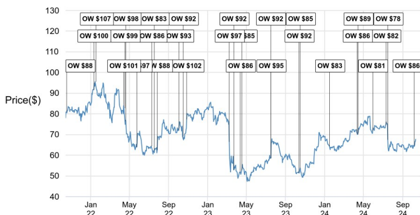
Charles Schwab (SCHW, SCHW US) Price Chart

Source: Bloomberg Finance L.P. and J.P. Morgan; price data adjusted for stock splits and dividends. Initiated coverage May 01, 1999. All share prices are as of market close on the previous business day.